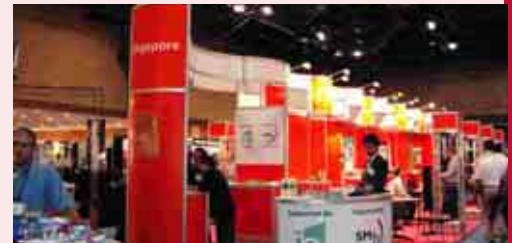
▲ Singapore Pavilion at MD&M East 2006

"MD&M East 2006 gave Forefront Medical Technology (FMT) the opportunity to get close to our potential clients in the US, thus strengthening our commitment to possible