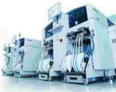
▲ The latest machine platform SIPLACE D-Series - manufactured in SIPLACE Center Asia

The FTSCs were particularly impressed with the facilities at SIPLACE Center and gained a deeper understanding of the range of operations that are being performed in a leading electronics firm and the varied job opportunities in the electronics sector. The talk-cum-site visit has left a very good impression in the minds of the FTSCs as initial feedback from them rated the programme as "informative, interesting, eye-opening and useful".