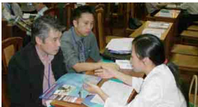
▲ One-to-one business meeting

In Ho Chi Minh City, the delegates were briefed on the latest economic updates and development of the country and were given first-hand information on the investment and trade opportunities available. Delegates also had the chance to network and to meet key Vietnamese officials and businessmen in Ho Chi Minh City where information and experience were exchanged. To provide further insights for the delegates, customized industrial and company visits were arranged for them to better understand the industrial development of the city.