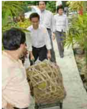
▲ Here comes the basket of durians!