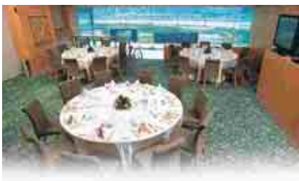
Bukit, Orchid Box