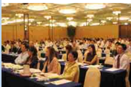
▲ Delegates at the Forum

The Forum was supported by the A*STAR, Infocomm Development Authority of Singapore (IDA), Standards, Productivity and Innovation Board (SPRING Singapore) International Enterprise (IE Singapore), IT Standards Committee of Singapore (ITSC), Singapore Exhibition and Convention Bureau, ECR Singapore as well as Spartan System (S) Pte Ltd. The Forum sponsors were BEA Systems, NEC Solutions Asia Pacific, Sato Asia Pacific Pte Ltd, Sun Microsystems and Zebra Technologies Asia Pacific, LLC.