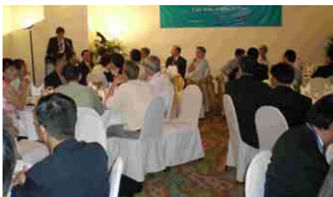
▲ Networking Dinner on 3 July 06