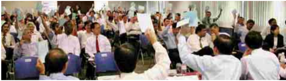
▲ The voting begins...