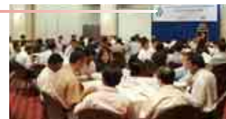
▲ Participants attending the Responsible Care Best Practices Sharing Seminar 2006

Rockwood Specialties (Singapore) Pte Ltd