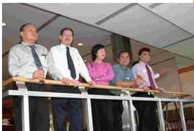
Members waiting for the 1st race to start...

Some members not only walked away from the night's session with new business opportunities, but also left with a relatively heavier pocket from the night's winning bets.