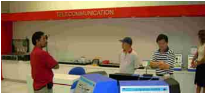
▲ Members visiting one of the laboratories at ITE College East

To get a glimpse of the state-of-the-art facilities of Singapore's technical/vocational institutions, 17 SMA members visited ITE College East on 25 April 2006. Officially launched on 24 March 2006, ITE College East is the first of 3 regional campuses to be built on ITE's "One System, Three Colleges" model of technical education.