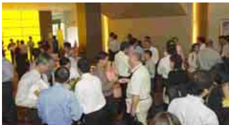
▲ Senior Executives mingling with each other during the networking session