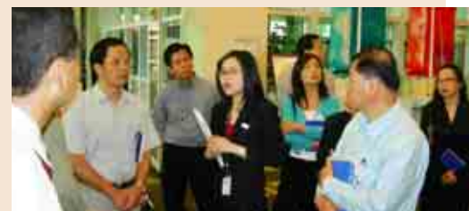
▲ Getting to know the selection of electronic databases at the Business Collection section...

After an eye-opening tour of the library, members were brought to the Pod on level 16 where they enjoyed the spectacular view of Singapore's city centre skyline while having refreshments.