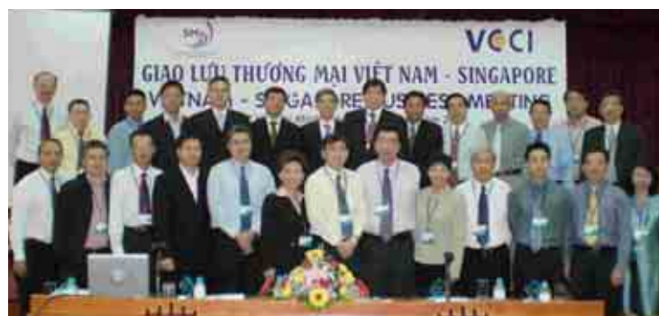
▲ The Singapore delegates